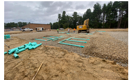
Above: Progress of new septic system.