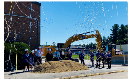
Above: Groundbreaking Ceremony.