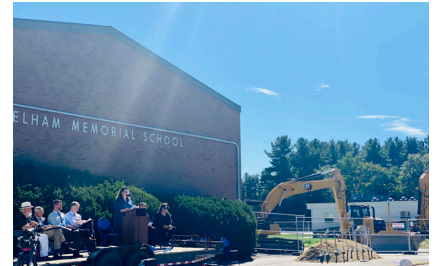
Above: Groundbreaking Ceremony.