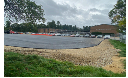
Above: Base pavement of new parking lot.