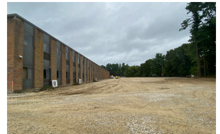
Above: Site work progress east of classroom wing.