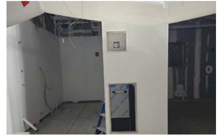
Above: Progress with finish work