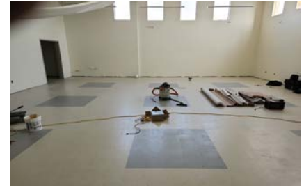
Above: Flooring installation at new addition.

Phase 9: The final phase includes the renovation of the balance of the existing 1st floor classroom wing, and miscellaneous exterior work on and around the building.